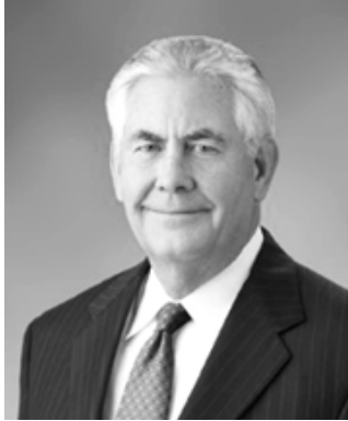
REX W. TILLERSON Chairman and Chief Executive Officer ExxonMobil Corporation 2014 Keynote Speaker

A native of Wichita Falls, Texas, Rex Tillerson earned a Bachelor of Science degree in civil engineering at the University of Texas at Austin before joining Exxon Company, U.S.A. in 1975 as a production engineer.